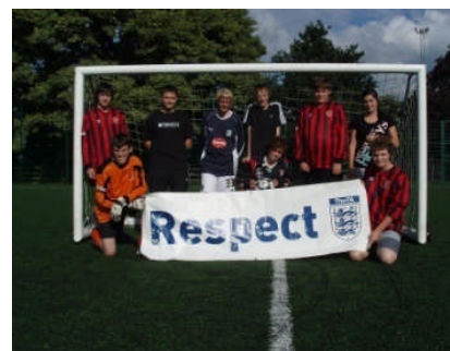
Above: Tavistock Specials (Winners: League 2)

League 2 in 2010/11 has always had an air of unpredictability about it; for instance on the opening day of the season bottom placed finishers Exeter City had a fine win over eventual champions Tavistock Specials. The Specials however have enjoyed an excellent debut season, leading the table since October, and despite some last day upsets in losing to ROC Active Exeter and Torquay Utd, the Specials did enough to seal the title with wins over Exeter City and Free Spirits. Plymouth Argyle Pilgrims were never too far behind however, and put in strong finish to the season to eventually finish only 2 points behind Tavistock. Elsewhere in the league, Bideford Blues just managed to sneak into 3 rd ahead of debutants Newton Soccability and ROC Active Exeter. Torquay Utd Inspirations won the Fair Play Award in League 2, with the highest Sportsmanship marks awarded in all of the divisions, an excellent achievement.