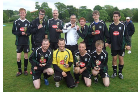
Above: Plymouth Argyle Pilgrims (Winners: Championship)

Whilst League 1 has seen a number of very evenly matched teams in 2010/11, throughout the season one team has been above the rest, and Plymouth Argyle retained their Devon Ability Counts League 1 title with some style losing only one game through the season. Plymouth Argyle Reserves cemented a 2 nd place finish on the final weekend by going undefeated, and with Exeter City (3 rd ) unable to close the gap. Lower down Horizon Hotshots finished the season strongly with draws against higher placed teams and a win over Torquay Utd Inspirations. Hotshots also capped off the day by winning the Divisions Fair Play Award for the season, voted for by referees and other teams.