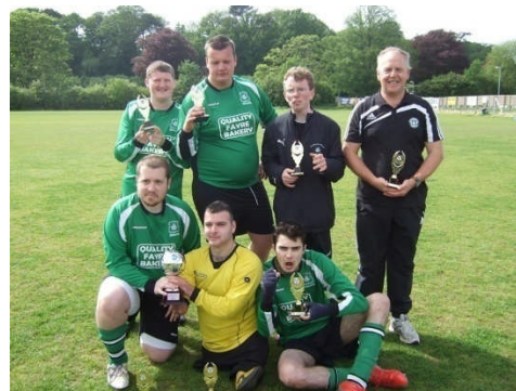
Above: Plymouth Argyle (Winners: League 1)